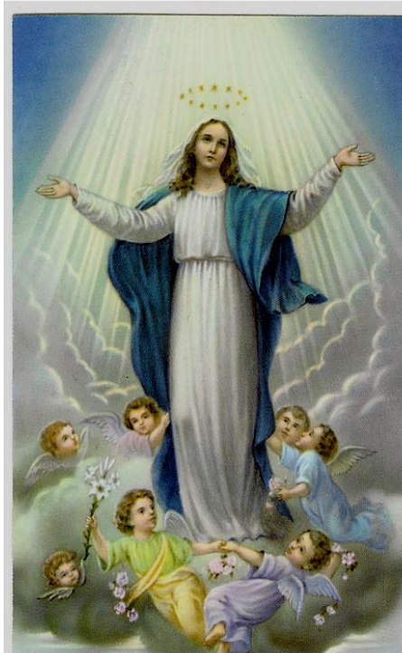
The Assumption of the Blessed Virgin Mary

MASS TIMES Holy Cross Tramore Saturday 10am & 7.30pm (Vigil) Sunday 8.30am, 10.30am and 12 noon Monday – Friday 10am CONFESSIONS Saturday 10.30am & 7pm and upon Request NOVENA OUR LADY OF PERPETUAL HELP Mondays after 10am Mass EXPOSITION OF THE BLESSED SACRAMENT Thursday after 10am Mass until 5pm Our Lady's Carbally Sunday at 11.30am OTHER LOCAL CHURCHES MASS TIMES Church of the Immaculate Conception Fenor Saturday Vigil at 6pm Sacred Heart Dunhill Sunday at 9.30am